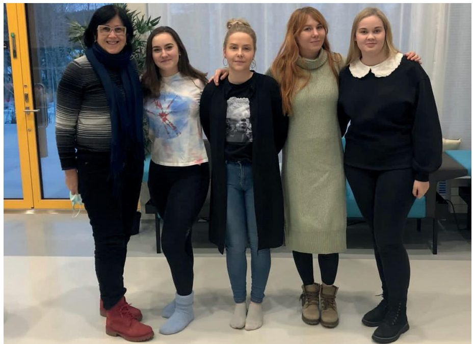
Meetings with colleagues from Humak University, UFES, and Robert Gordon University